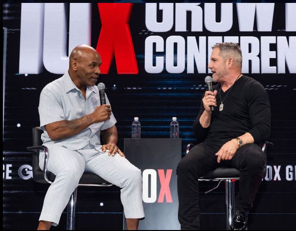
MIKE TYSON AND GRANT CARDONE