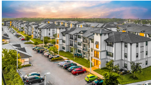
10X AT THE FORUM