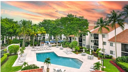
10X AT JACARANDA