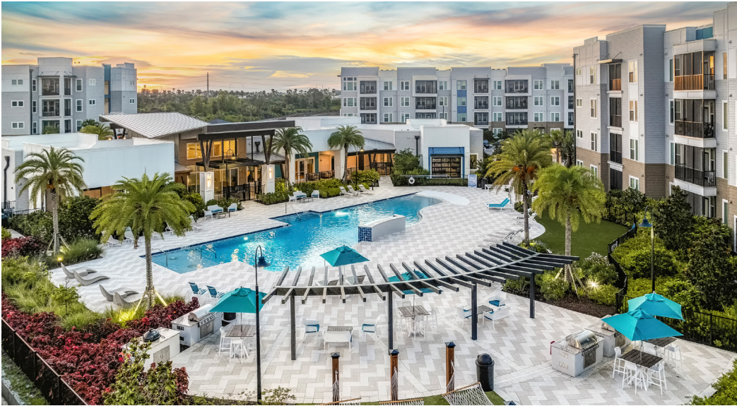
10X SPACE COAST TOWN CENTER