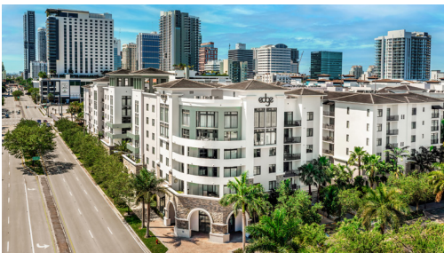
THE EDGE AT FLAGLER VILLAGE